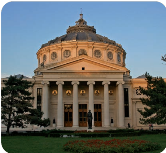
The Romanian Athenaeum is a unique concert hall and a cultural landmark of the city

Also known as Lipscani or the Historical Centre, it features a large array of themed cafes and bars, cozy clubs and international or traditional restaurants. Important landmarks such as Caru' cu Bere restaurant, Stavropoleos church or the National Bank building are also located in this area.